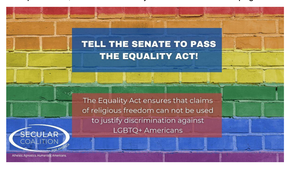
Tell the Senate to Support the Equality Act - Secular Coalition for America

It is important that we dispel these <u>untrue myths</u> about this legislation, which seeks only to provide the same protections that most of us already are afforded to those who are not. We must always push back against these false narratives whenever they are presented. Only by doing so will we be able to do away with the myths and focus on the <u>facts of the issue</u>, which is equal treatment under the law for everyone, regardless of race, Religion, gender, sexual identity, or sexual orientation.